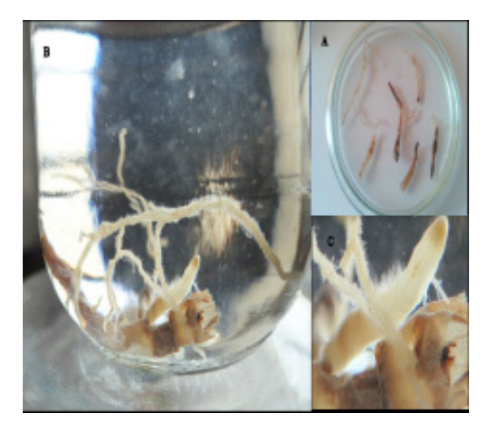
Figure 2: Developed hairy root culture of Chlorophytum laxum A) Co cultivated explants of Chlorophytum laxum for 3 nights B) Developed hairy roots of Chlorophytum laxum after 9 - 10 days of co – cultivation and subculture C) close view of developed hairy roots