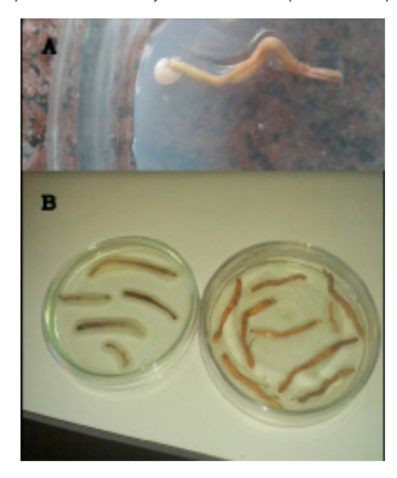
Figure 1: Explants of Chlorophytum comosum and Chlorophytum laxum after infected with Agrobacterium strain R1000 A) Chlorophytum comosum showing bacterial colony B) Chlorophytum laxum showing susceptibility to Agrobacterial strain R1000 and while Chlorophytum comosum is not showing infection

From previous research work on hairy root culture, it is observed that monocot species give less response to induction of hairy roots because they lack ability to produce chaemotactic effect in order to attract agro bacterium and cause transformation. Hence, very few examples of monocot hairy root culture are reported. Plant species