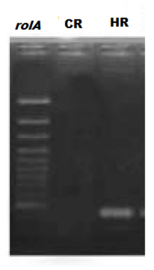
Figure 5: PCR analysis of hairy roots for confirmation of transgenicity where rolA is marker, CR: Chlorophytum roots, HR: hairy roots after infection with A. rhizhogenes

Figure 4: Thin Layer Chromatography of transformed and non transformed tissue of Chlorophytum laxum A) sample of non transformed tissue B) sample of transformed tissue